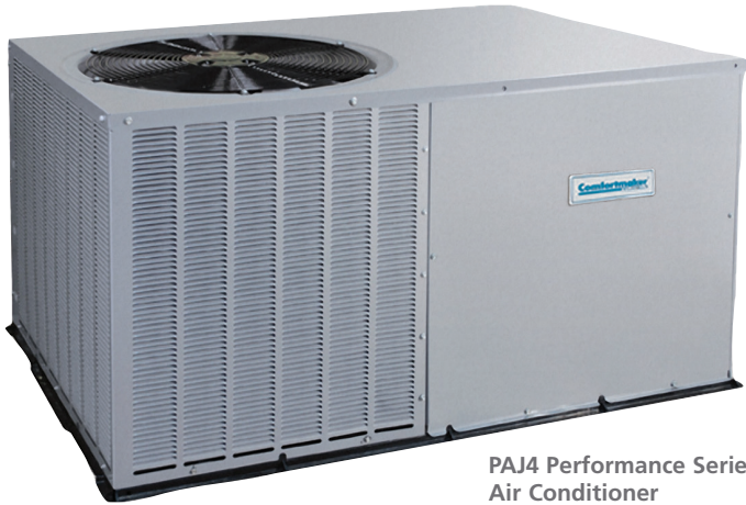
PAJ4 Performance Series Air Conditioner

Get the most out of a packaged system by choosing the product that fits your comfort needs. All of our packaged products feature comfort-enhancing and durable features to deliver lasting performance. For greater efficiency in a unit, look for two-stage heating or cooling operation. Our toughest units feature wire hail guard grilles, tin-plated copper evaporator coil tubing, and stainless steel heat exchangers (in gas heating units). And our No Hassle Replacement™ limited warranty is offered on our premium products to give you peace of mind. Comfortmaker packaged units offer money savings, increased comfort, durable performance and quiet operation.