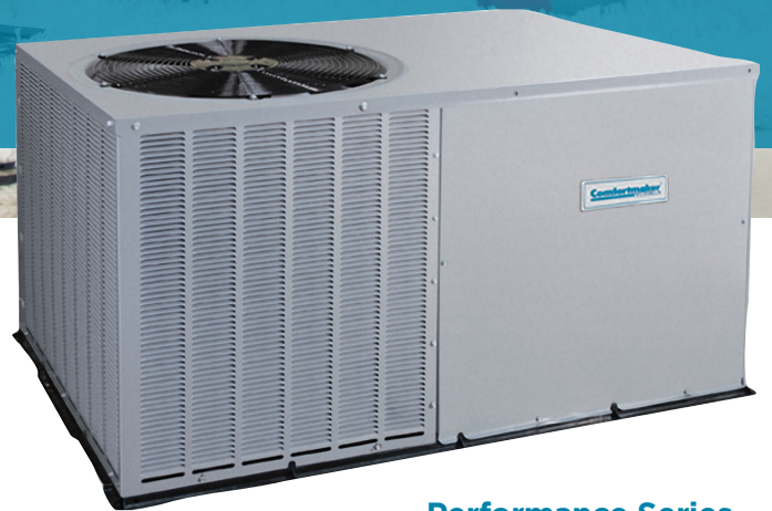
Performance Series PAJ4/PHJ4